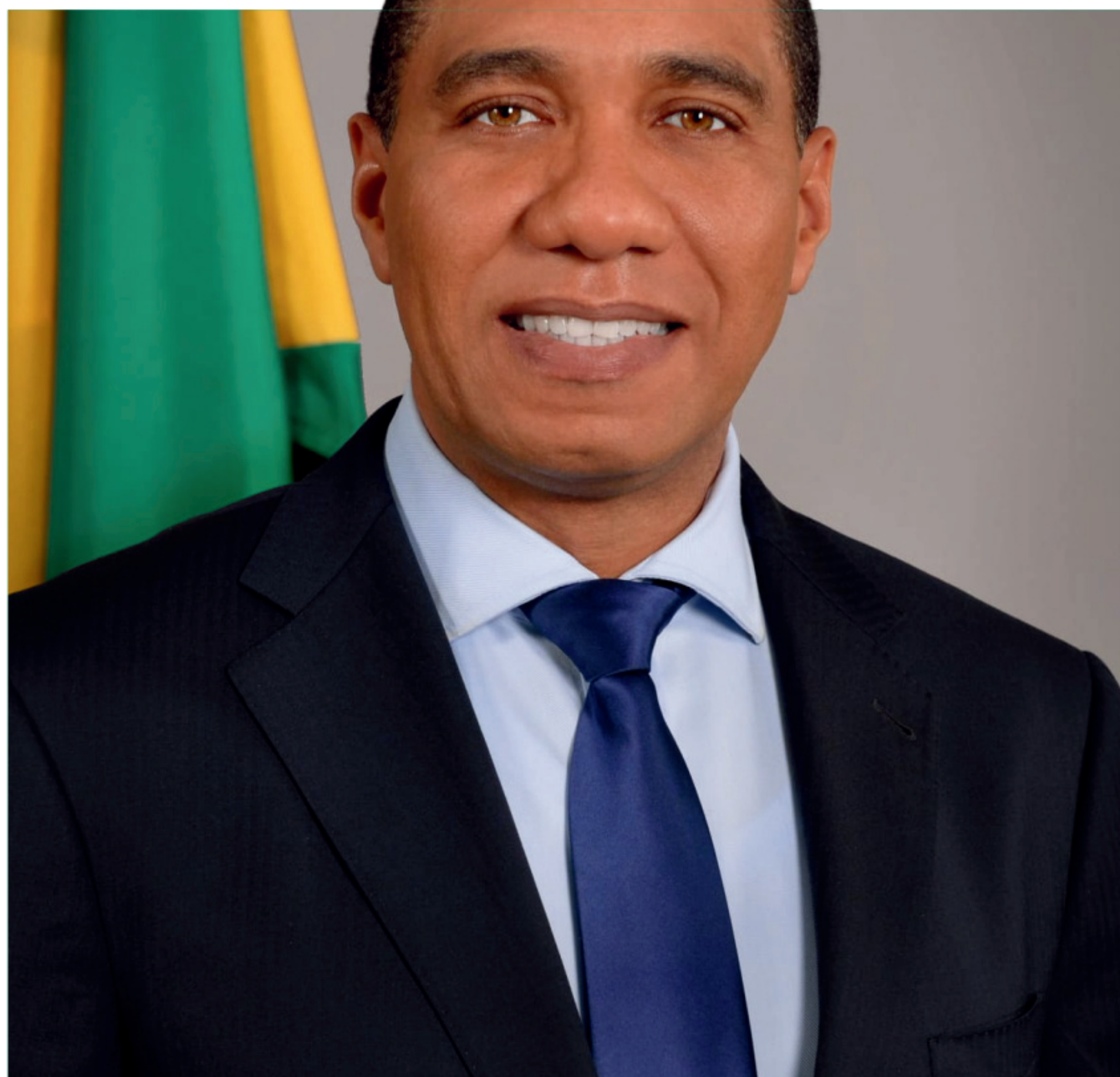
Dr. The Most Honourable Andrew

Holness, ON, PC, MP Prime Minister Jamaica